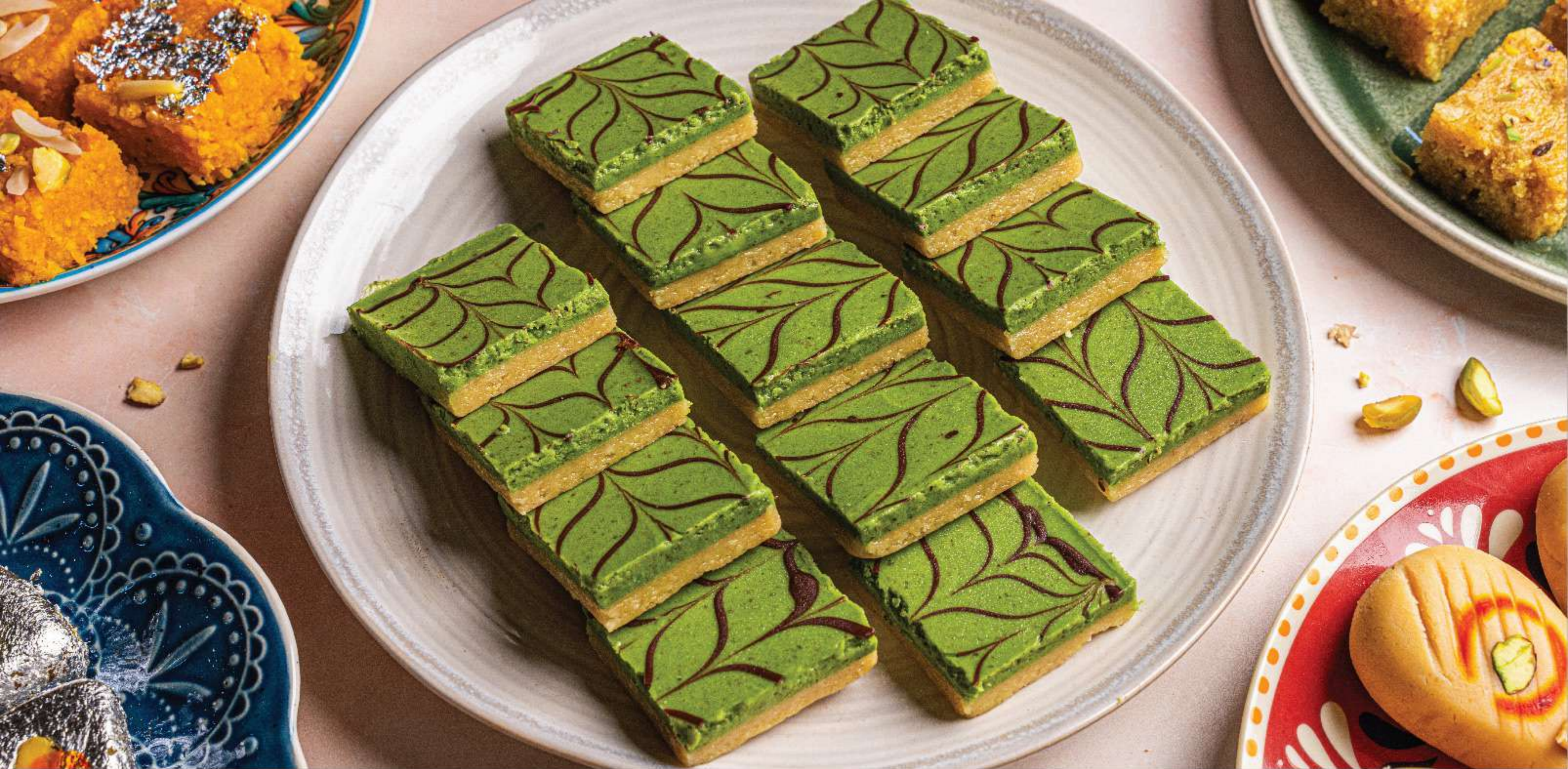
PISTA CHOCOLATE KAJU KATLI