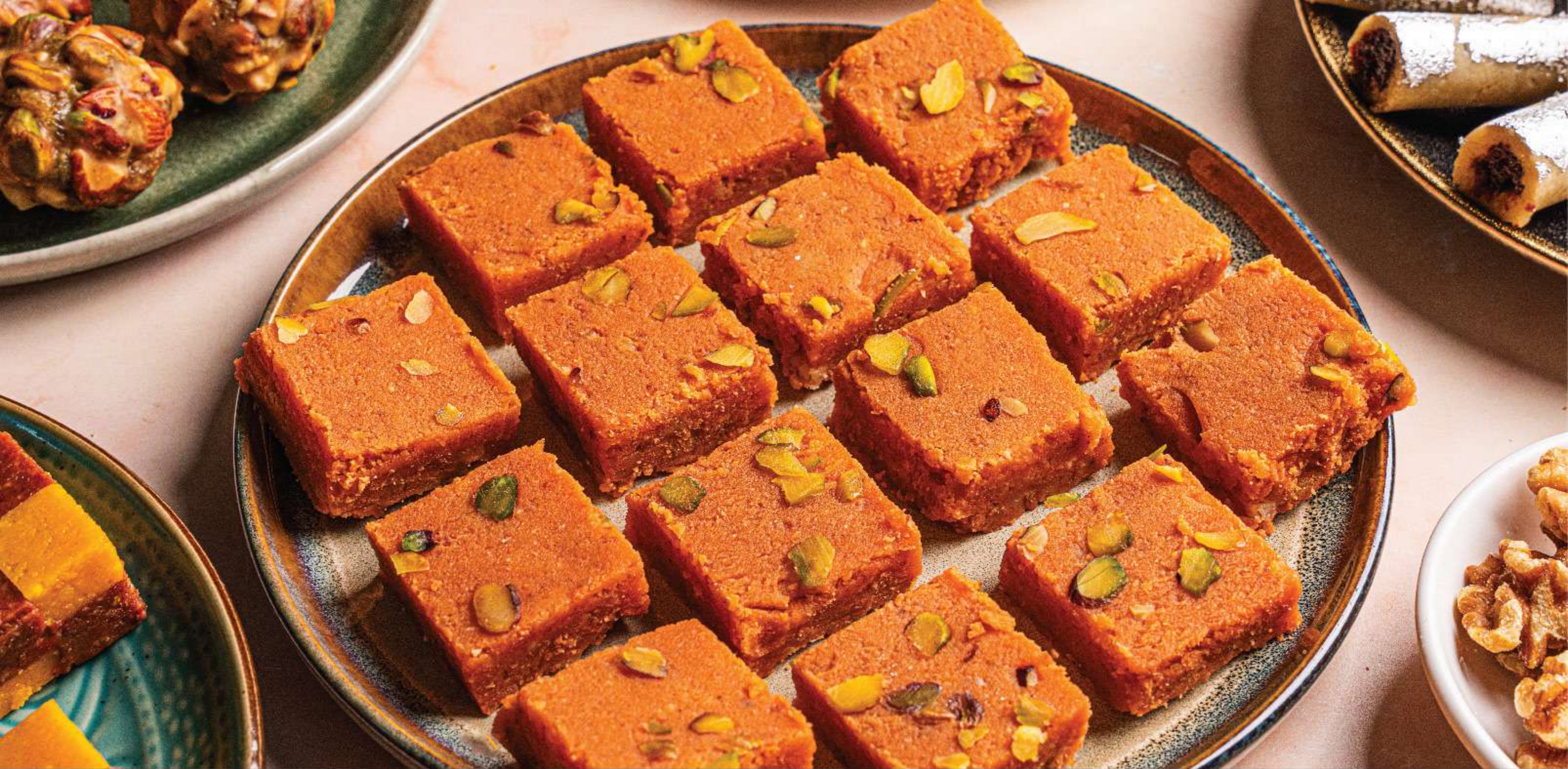
WALNUT MAWA BARFI