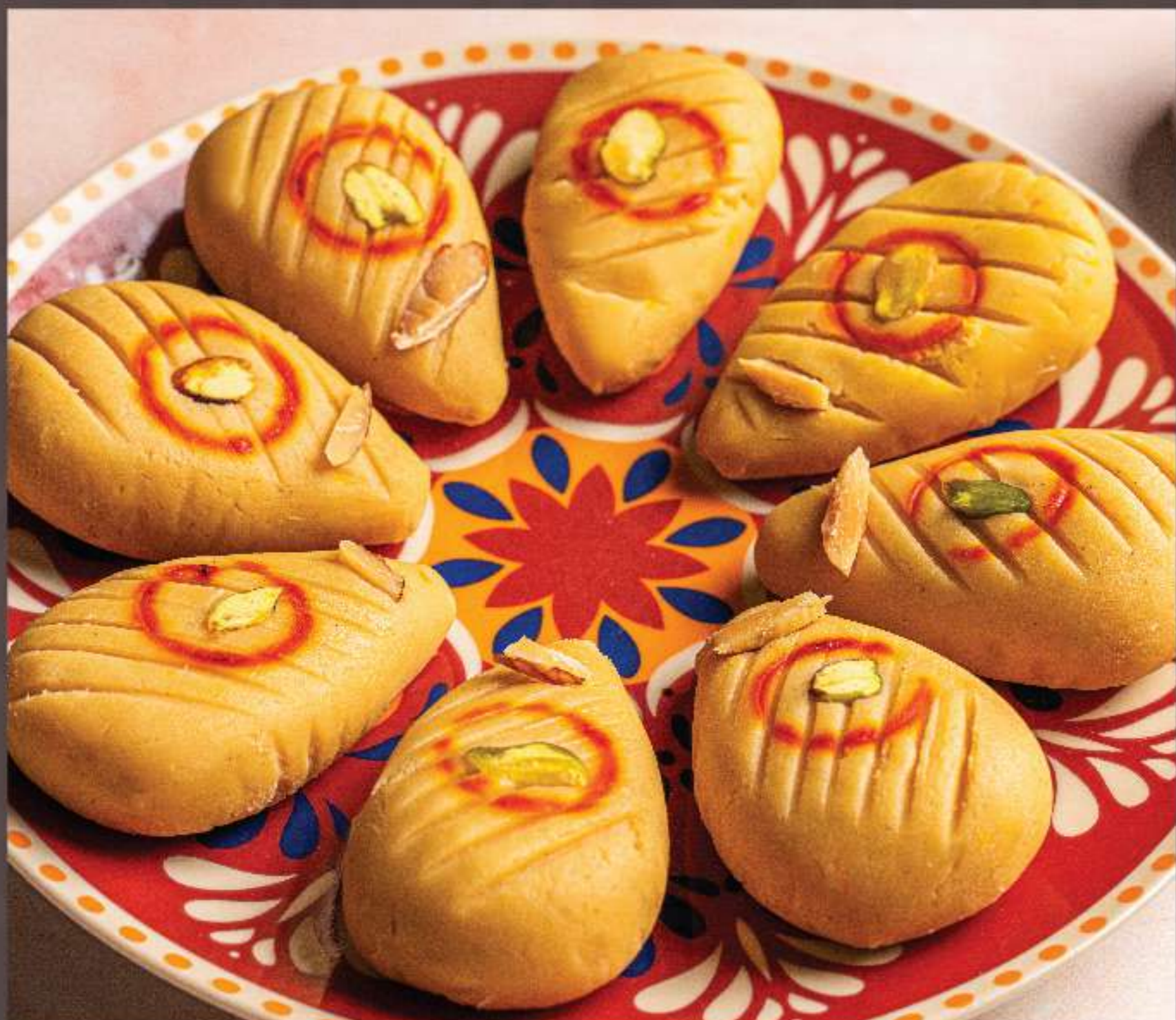
MAWA MISHRI MALAI