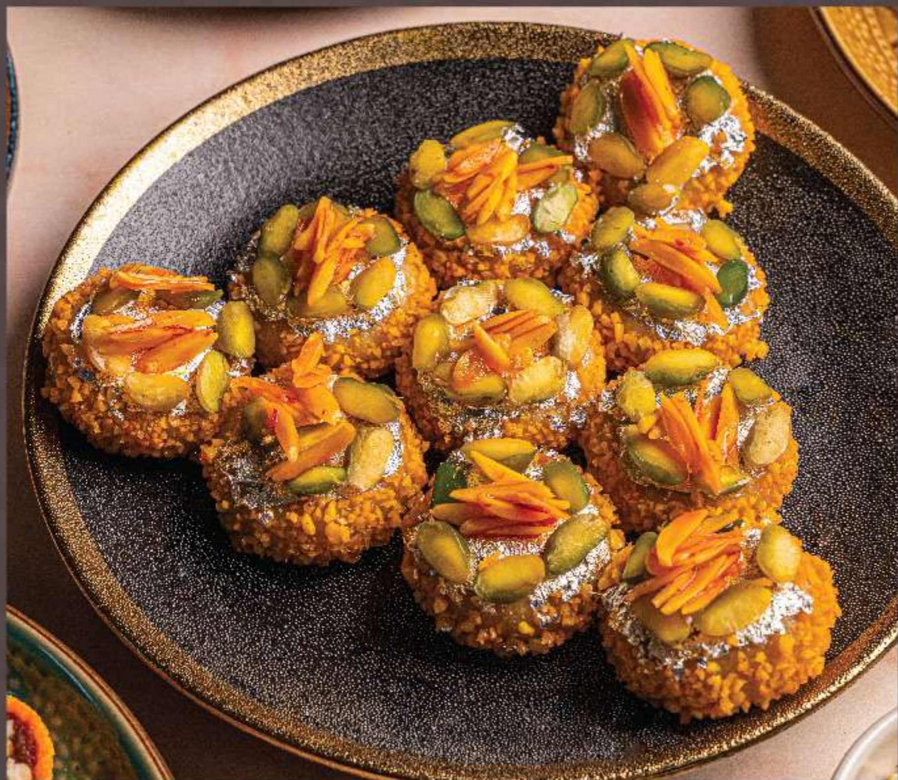
KAJU KESAR BHATTI