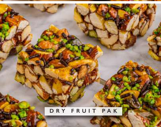
DRY FRUIT PAK